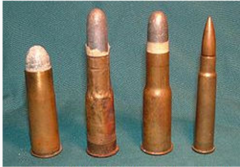
(From Left to Right): A .577 Snider cartridge, a Zulu War-era rolled brass foil .577/450 Martini-Henry Cartridge, a later drawn brass .577/450 Martini-Henry cartridge, and a .303 British Mk VII SAA Ball cartridge