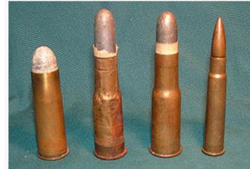
(From Left to Right): A .577 Snider cartridge, a Zulu War-era rolled-brass-foil .577/450 Martini-Henry Cartridge, a later drawn-brass .577/450 Martini-Henry cartridge, and a .303 British Mk VII SAA Ball cartridge.